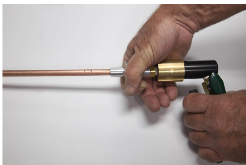
A quick twist ejects the old rod stub.

PC/SNAPNUT torch nut with quick connect coupler PC/SNAPFIT38-25 cutting rod end fittings to fit 3/8" diameter cutting rods. (Bag of 25 pieces.) PC/SNAPFIT12-25 cutting rod end fittings to fit 1/2" diameter cutting rods. (Bag of 25 pieces.)