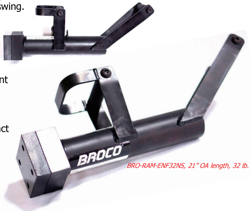
BRO-RAM-ENF32NS, 21" OA length, 32 lb.

Broco Enforcer rams have been NTOA Member Tested and Recommended!